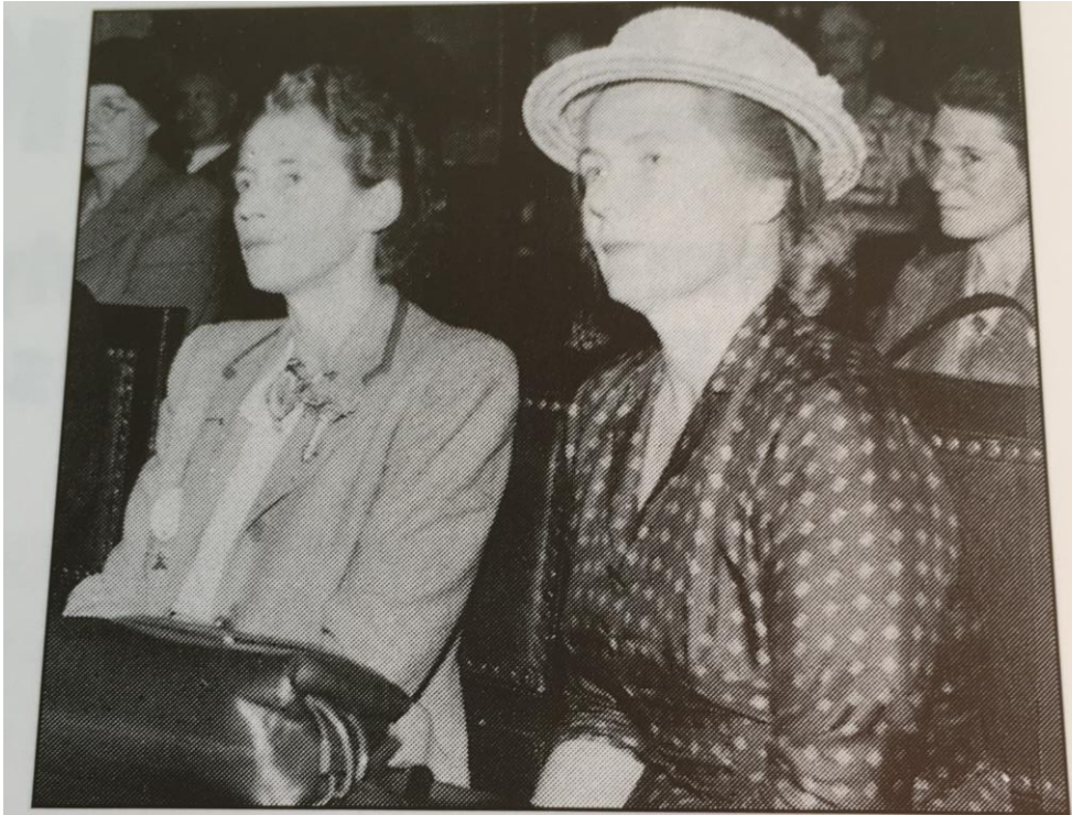
Lady Allen and Alva Myrdal